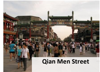
Qian Men Street

After breakfast, we will proceed to Tianjin . We will visit the Italian Street in Tianjin for a unique experience with the streets designed in Italian Style. After that, continue to Tianjin Food Street and Cultural Street . For lunch, we will be having Tianjin's famous Goubuli Buns before heading back to Beijing.