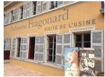
Fragonard Perfume Factory

This morning, we take a breathtaking drive along one of Europe's most famous stretches of Mediterranean coastline as we head towards Monaco. A walking sightseeing tour here takes you to the grand Prince's Palace , where we will have some free time, before continuing to view 1920s Courthouse , the Cliffside Oceanographic Museum , and the Cathedral , where Grace Kelly is buried. We then travel further to visit the famous Fragonard Perfume Factory . Here, we will be taken on a fascinating guided tour around this working factory. Afterwards, we proceed to Nice, where we will stop for lunch to sample some excellent local cuisine and warm-hearted hospitality. Our journey continues to Cannes, where we will stop for photos of the Palais des Festival , home to the city's annual international film festival, before transferring to Avignon Nord. Overnight in Avignon or a nearby city.