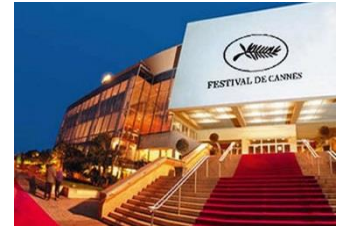
Palais des Festival