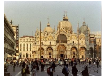
Basilica di San Marco