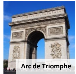
Arc de Triomphe

After leaving Amsterdam in the morning you'll head south across the border into Brussels. On the way, the tour stops to see the distinctive Atomium monument , a cell-shaped structure of stainless steel spheres and tubes built for the 1958 World's Fair. In the centre of Brussels itself an orientation tour will call in at the exquisite Grand Place , as well as seeing the famous impish MannekenPis Statue . After some free time, during which you can try some mouth-watering Belgian delights. Then from Brussels, you will head to Paris.